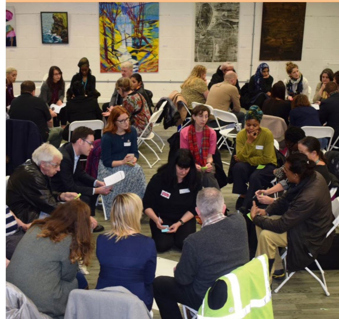
◀ Community Network meeting held in February 2019

A post-programme survey will also be undertaken once the first wave of the programme concludes, and the results compared with the local area baseline survey recently conducted to measure current attitudes and behaviours. The results will hopefully provide objective data to measure the progress made on our integration journey.